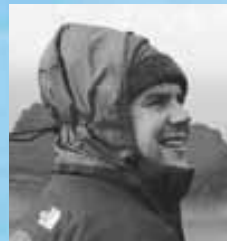
Iain Finlay Macleod